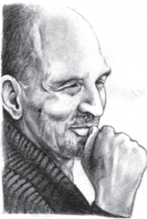
Ingmar Bergman 1918-2007

Ingmar Bergman is a well known Swedish director of films noted for their starkness, their subtle use of black and white and 'shades' of those extremes, the ambiguity of their content, and a certain brooding presence that seems to pervade them all. The list of Bergman films is long; his best known include The Seventh Seal (1957), Wild Strawberries (1958), The Virgin Spring (1960), The Silence (1963), Persona (1967), The Passion of Anna (1970), and Cries and Whispers (1973)—this last film in colour, though emphasising red in all its shadings. In the following selection, the Introduction to Four Screen-plays by Ingmar Bergman (1960), Bergman discusses how he views the art of film-making.