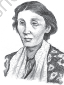
Virginia Woolf 1882-1941

This essay records fleeting impressions and delicate shades of mental experience.