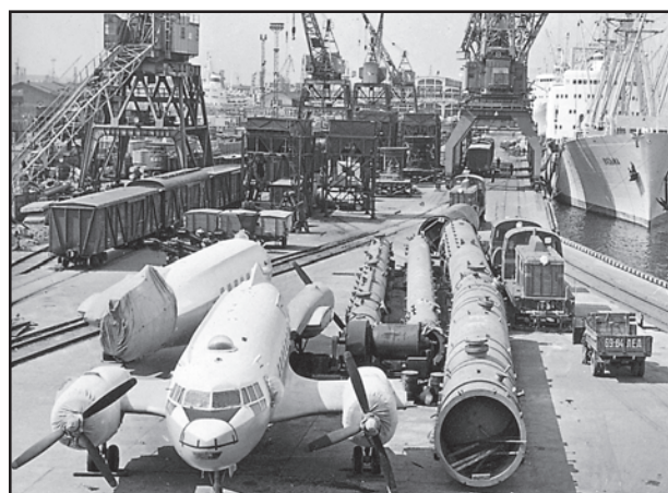
Fig. 9.6: Leningrad Commercial Port