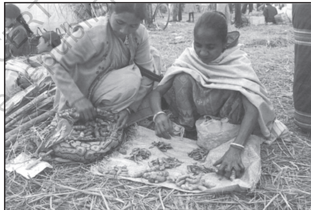
Fig. 9.1: Two women practising barter system in Jon Beel Mela

The initial form of trade in primitive societies was the barter system , where direct exchange of goods took place. In this system if you were a potter and were in need of a plumber, you would have to look for a plumber who would be in need of pots and you could exchange your pots for his plumbing service.