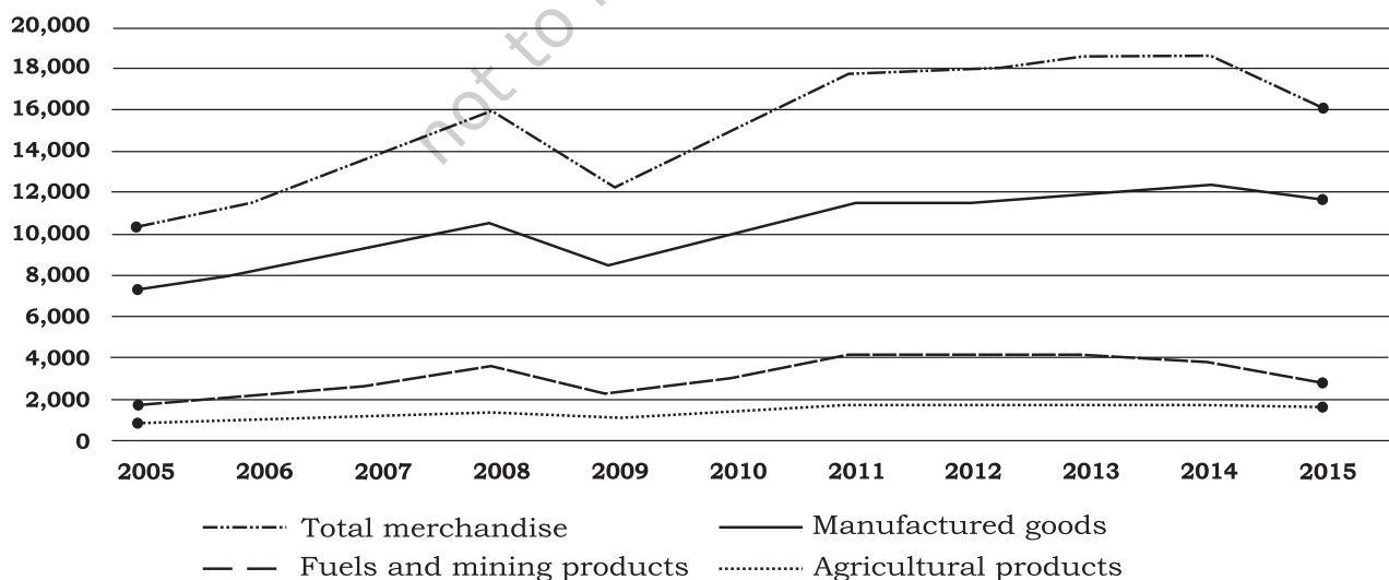
Fig. 9.1 World merchandise exports, 2005-2015

Source: wits.worldbank.org as on 21.07.17