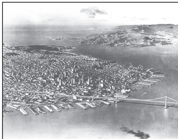
Fig. 9.5: San Francisco, the largest land-locked harbour in the world

The ports provide facilities of docking, loading, unloading and the storage facilities for cargo. In order to provide these facilities, the port authorities make arrangements for maintaining navigable channels, arranging tugs and barges, and providing labour and managerial services. The importance of a port is judged by the size of cargo and the number of ships handled. The quantity of cargo handled by a port is an indicator of the level of development of its hinterland.