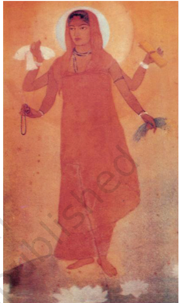
Fig. 12 – Bharat Mata, Abanindranath Tagore, 1905. Notice that the mother figure here is shown as dispensing learning, food and clothing. The mala in one hand emphasises her ascetic quality. Abanindranath Tagore, like Ravi Varma before him, tried to develop a style of painting that could be seen as truly Indian.

Ideas of nationalism also developed through a movement to revive Indian folklore. In late-nineteenth-century India, nationalists began recording folk tales sung by bards and they toured villages to gather folk songs and legends. These tales, they believed, gave a true picture of traditional culture that had been corrupted and damaged by outside forces. It was essential to preserve this folk tradition in order to discover one’s national identity and restore a sense of pride in one’s past. In Bengal, Rabindranath Tagore himself began collecting ballads, nursery rhymes and myths, and led the movement for folk