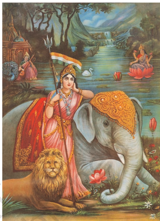
Fig. 14a – Bharat Mata.

This figure of Bharat Mata is a contrast to the one painted by Abanindranath Tagore. Here she is shown with a trishul, standing beside a lion and an elephant – both symbols of power and authority.