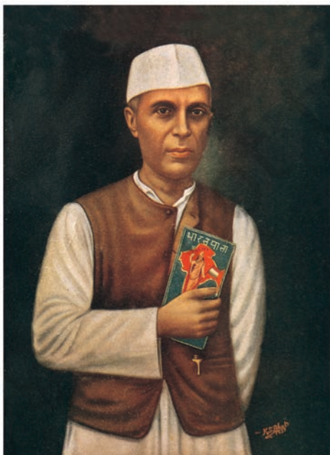
Fig. 13 – Jawaharlal Nehru, a popular print. Nehru is here shown holding the image of Bharat Mata and the map of India close to his heart. In a lot of popular prints, nationalist leaders are shown offering their heads to Bharat Mata. The idea of sacrifice for the mother was powerful within popular imagination.