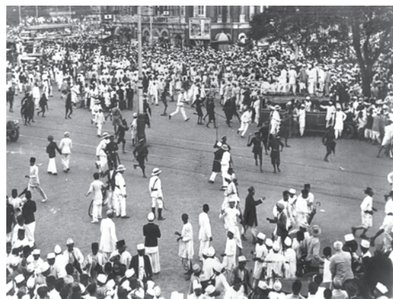
Fig. 8 – Police cracked down on satyagrahis, 1930.

In such a situation, Mahatma Gandhi once again decided to call off the movement and entered into a pact with Irwin on 5 March 1931. By this Gandhi-Irwin Pact, Gandhiji consented to participate in a Round Table Conference (the Congress had boycotted the first