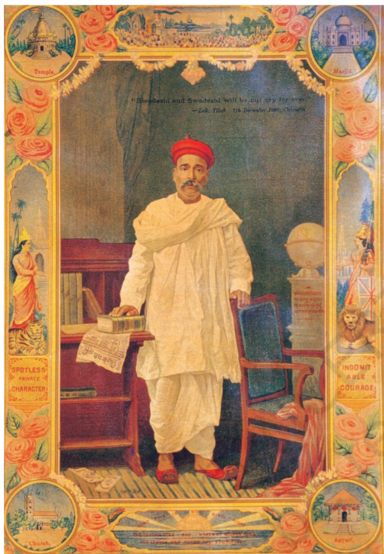
Fig. 11 – Bal Gangadhar Tilak, an early-twentieth-century print. Notice how Tilak is surrounded by symbols of unity. The sacred institutions of different faiths (temple, church, masjid) frame the central figure.

Nationalism spreads when people begin to believe that they are all part of the same nation, when they discover some unity that binds them together. But how did the nation become a reality in the minds of people? How did people belonging to different communities, regions or language groups develop a sense of collective belonging?